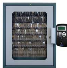
flexx 12U 64/128 keyTags