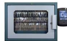
flexx 6U 32/64 keyTags