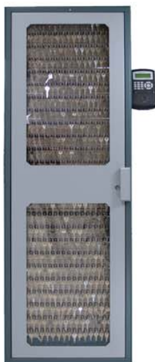
flexx 36U 384 keyTags