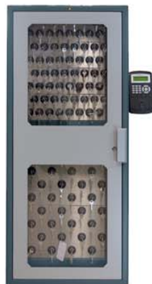
flexx 24U 128/256 keyTags